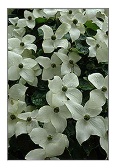
Chinese Dogwood flowers

Bossier City - Shreveport - Longview - Texarkana - Beaumont