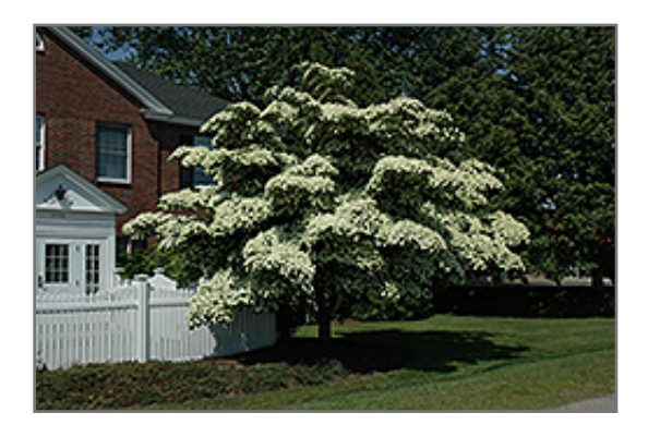
Chinese Dogwood in bloom

This is a relatively low maintenance tree, and should only be pruned after flowering to avoid removing any of the current season's flowers. It is a good choice for attracting birds to your yard. It has no significant negative characteristics.