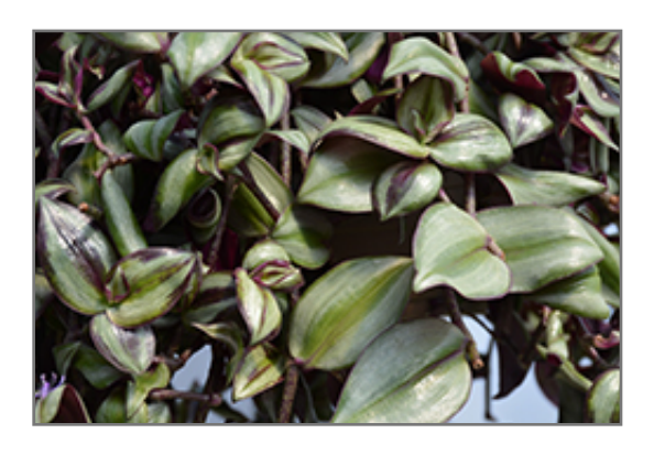
Wandering Jew foliage