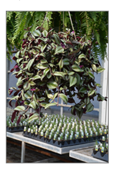
Wandering Jew