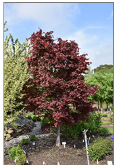
Samurai Sword Japanese Maple