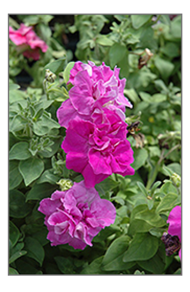
Double Madness Lavender Petunia flowers