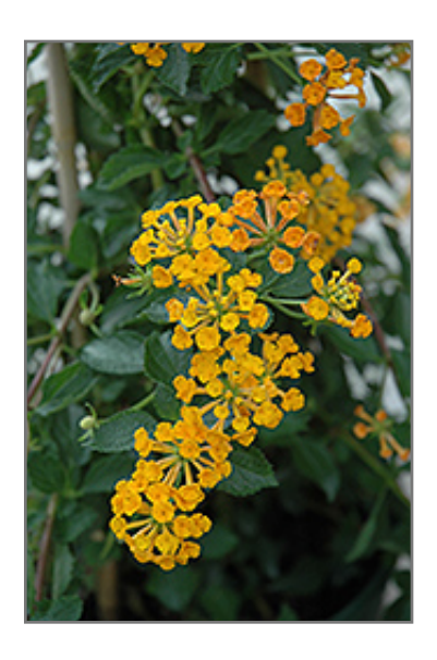
Tangerine Lantana flowers

Tangerine Lantana will grow to be about 24 inches tall at maturity, with a spread of 5 feet. It has a low canopy. It grows at a fast rate, and under ideal conditions can be expected to live for approximately 20 years.