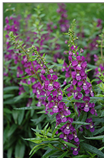
Serenita Purple Angelonia flowers