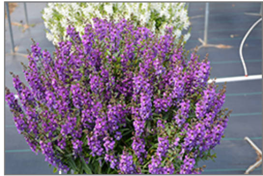
Serenita Purple Angelonia in bloom