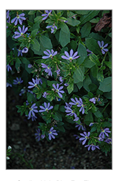
Surdiva Light Blue Fan Flower flowers