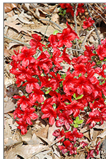
Encore Autumn Monarch Azalea in bloom