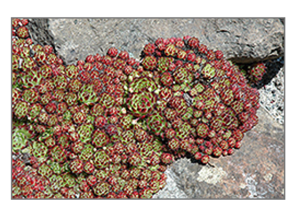
Hens And Chicks

Plant Height: 3 inches Flower Height: 6 inches Spread: 12 inches Spacing: 10 inches Sunlight: O Hardiness Zone: 4 Other Names: House Leek