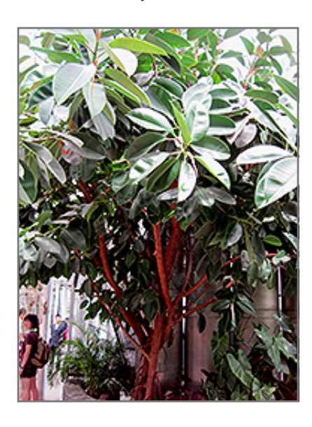
Rubber Tree