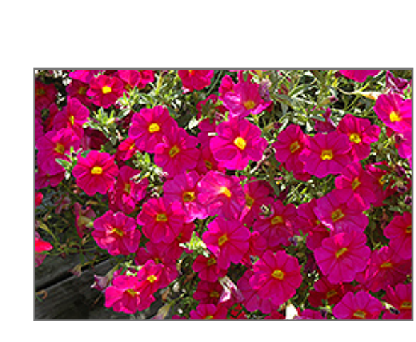
SuperCal Neon Rose Petchoa flowers

Bossier\ City-Shreveport-Longview-Texarkana-Beaumont