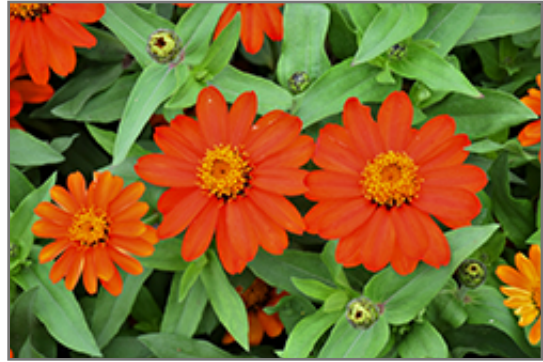
Zahara Fire Zinnia flowers

Zahara Fire Zinnia is recommended for the following landscape applications;