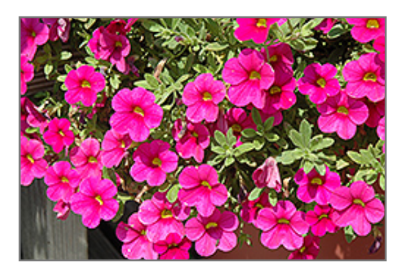
Million Bells Bouquet Brilliant Red Calibrachoa flowers