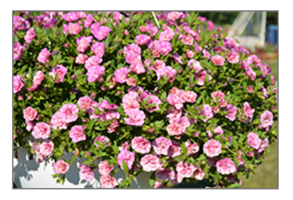
MiniFamous Double Pink Vein Calibrachoa in bloom

This plant will require occasional maintenance and upkeep. Trim off the flower heads after they fade and die to encourage more blooms late into the season. It is a good choice for attracting bees and hummingbirds to your yard, but is not particularly attractive to deer who tend to leave it alone in favor of tastier treats. It has no significant negative characteristics.