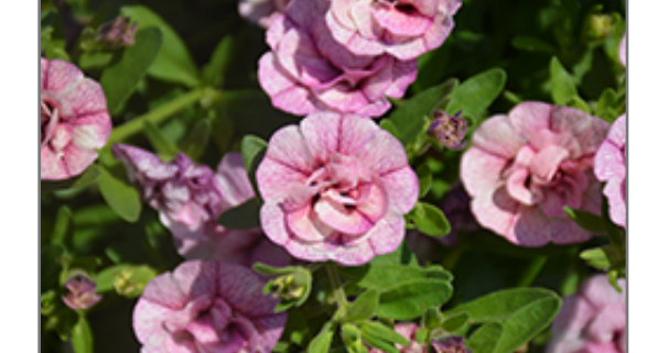
MiniFamous Double Pink Vein Calibrachoa flowers

MiniFamous Double Pink Vein Calibrachoa is a dense herbaceous annual with a trailing habit of growth, eventually spilling over the edges of hanging baskets and containers. Its medium texture blends into the garden, but can always be balanced by a couple of finer or coarser plants for an effective composition.