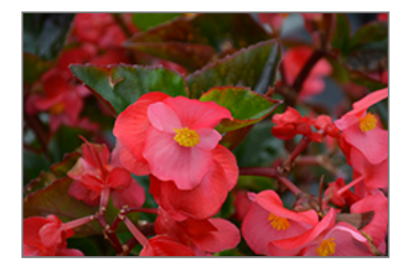
Big Rose Green Leaf Begonia flowers

Big Rose Green Leaf Begonia is an herbaceous evergreen perennial with an upright spreading habit of growth. Its medium texture blends into the garden, but can always be balanced by a couple of finer or coarser plants for an effective composition.