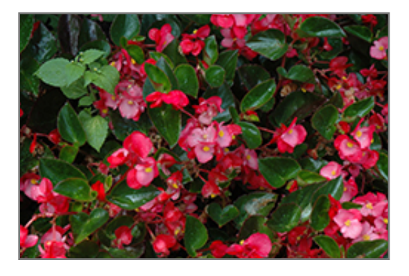
Big Rose Green Leaf Begonia flowers

This is a high maintenance plant that will require regular care and upkeep, and usually looks its best without pruning, although it will tolerate pruning. Deer don't particularly care for this plant and will usually leave it alone in favor of tastier treats. Gardeners should be aware of the following characteristic(s) that may warrant special consideration;