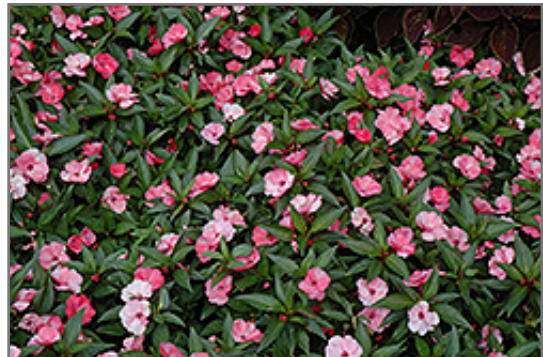
SunPatens Spreading Pink Flash New Guinea Impatiens in bloom