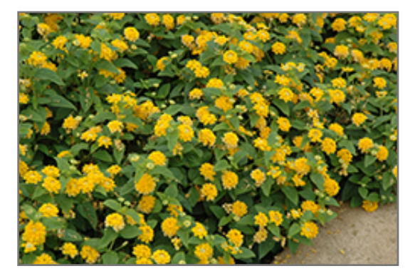
Little Lucky Pot Of Gold Lantana flowers

Little Lucky Pot Of Gold Lantana is a multi-stemmed evergreen shrub with a more or less rounded form. Its average texture blends into the landscape, but can be balanced by one or two finer or coarser trees or shrubs for an effective composition.