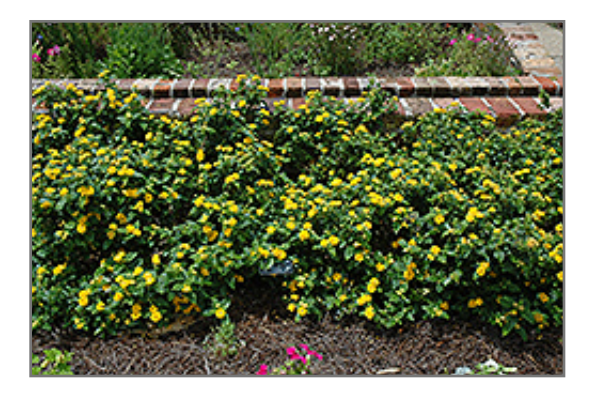
Little Lucky Pot Of Gold Lantana in bloom

This is a relatively low maintenance shrub, and should not require much pruning, except when necessary, such as to remove dieback. It is a good choice for attracting butterflies to your yard, but is not particularly attractive to deer who tend to leave it alone in favor of tastier treats. It has no significant negative characteristics.