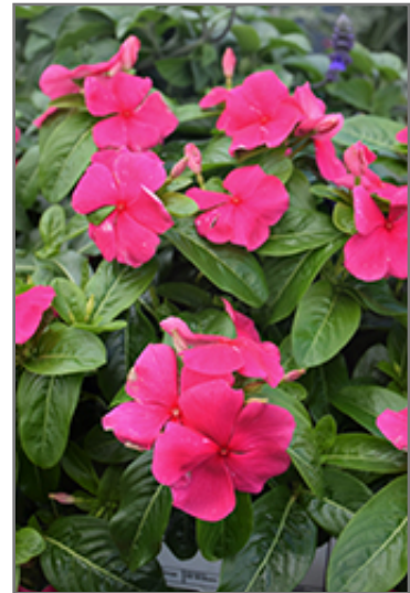
Titan Punch Vinca flowers

Titan Punch Vinca is recommended for the following landscape applications;