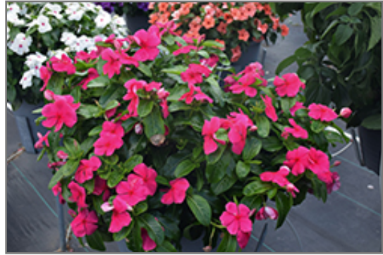
Titan Punch Vinca in bloom

Titan Punch Vinca will grow to be about 14 inches tall at maturity, with a spread of 12 inches. Its foliage tends to remain dense right to the ground, not requiring facer plants in front. It grows at a fast rate, and under ideal conditions can be expected to live for approximately 5 years. As an evergreen perennial, this plant will typically keep its form and foliage year-round.