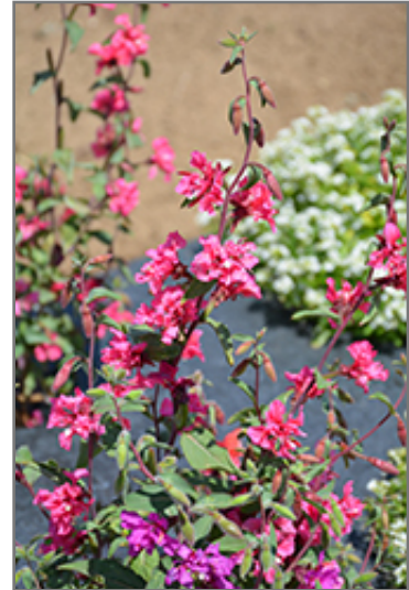
Sriracha Rose Cuphea flowers