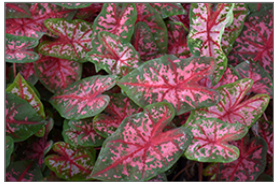
Carolyn Whorton Caladium foliage