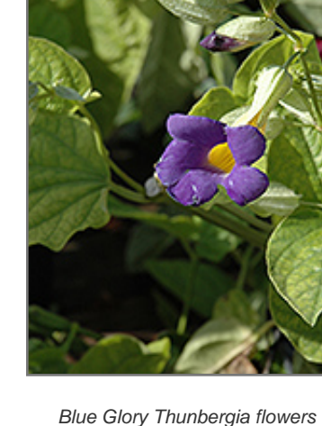
Blue Glory Thunbergia flowers