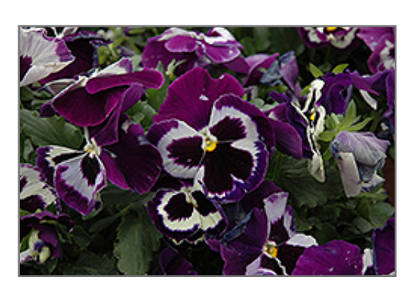
Delta Violet With Face Pansy flowers