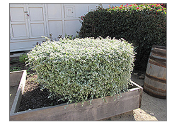
Licorice Plant

Heat and drought tolerant, excellent for hot and sunny borders, beds, hanging baskets and containers; produces trailing stems of velvety silver foliage with a slight licorice fragrance; easy to grow and low maintenance