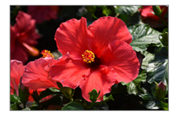
Starry Wind Hibiscus flowers