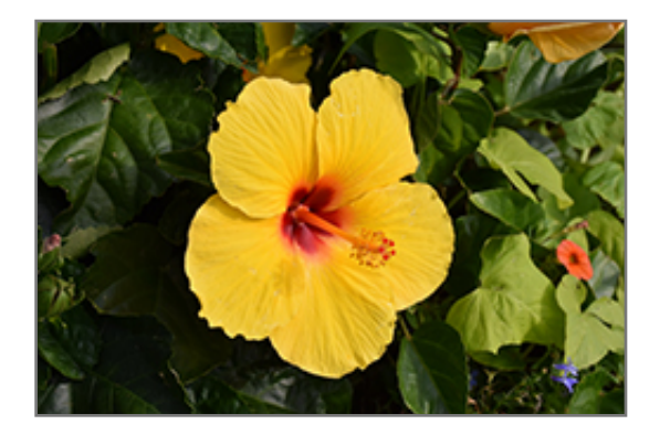
Sunny Wind Hibiscus flowers