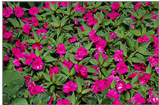
Big Bounce Violet Impatiens in bloom