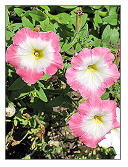
Madness Rose Morn Petunia flowers