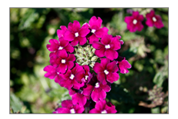
EnduraScape Purple Verbena flowers