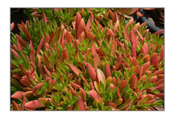
Campfire Crassula foliage

Campfire Crassula is recommended for the following landscape applications;