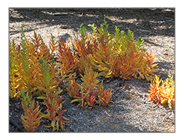
Campfire Crassula

Bossier\ City-Shreveport-Longview-Texarkana-Beaumont