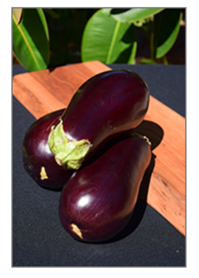
Eggplant fruit