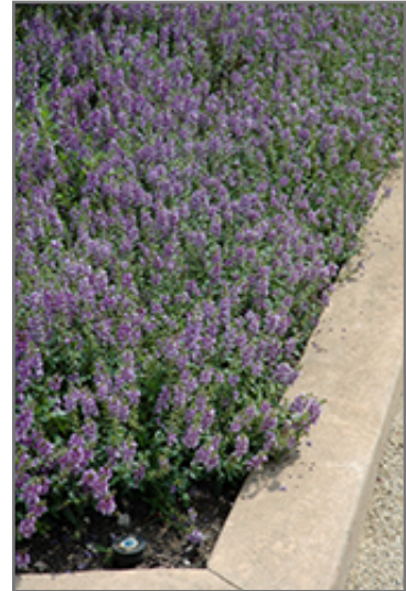
Serenita Sky Blue Angelonia in bloom

Serenita Sky Blue Angelonia is a fine choice for the garden, but it is also a good selection for planting in outdoor containers and hanging baskets. It is often used as a 'filler' in the 'spiller-thriller-filler' container combination, providing a mass of flowers against which the larger thriller plants stand out. Note that when growing plants in outdoor containers and baskets, they may require more frequent waterings than they would in the yard or garden.