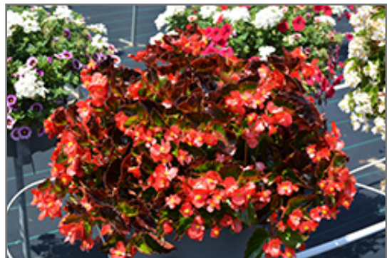
BabyWing Red Begonia in bloom