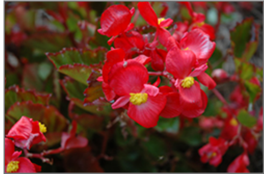
BabyWing Red Begonia flowers

BabyWing Red Begonia is a fine choice for the garden, but it is also a good selection for planting in outdoor containers and hanging baskets. It is often used as a 'filler' in the 'spiller-thriller-filler' container combination, providing a mass of flowers and foliage against which the thriller plants stand out. Note that when growing plants in outdoor containers and baskets, they may require more frequent waterings than they would in the yard or garden.