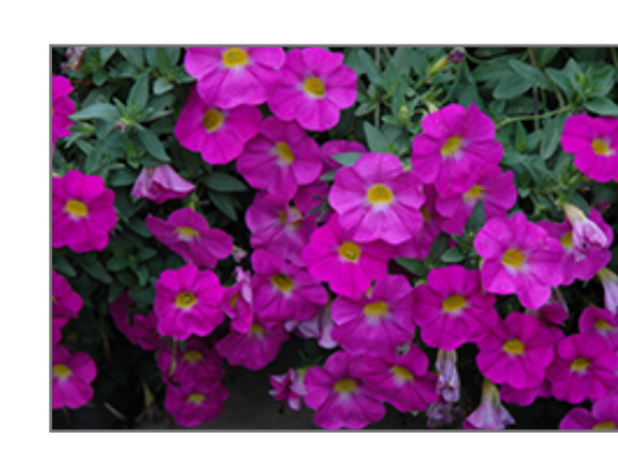
SuperCal Pink Petchoa flowers

Bossier\ City-Shreveport-Longview-Texarkana-Beaumont