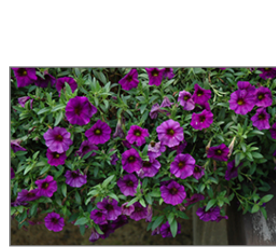
SuperCal Super Blue Petchoa flowers

Bossier\ City-Shreveport-Longview-Texarkana-Beaumont