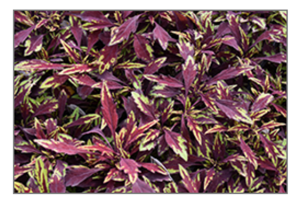
FlameThrower Chipotle Coleus foliage

This is a relatively low maintenance plant. The flowers of this plant may actually detract from its ornamental features, so they can be removed as they appear. Deer don't particularly care for this plant and will usually leave it alone in favor of tastier treats. It has no significant negative characteristics.