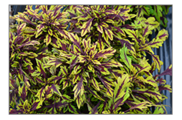
FlameThrower Chipotle Coleus foliage

FlameThrower Chipotle Coleus is an herbaceous evergreen perennial with a mounded form. Its medium texture blends into the garden, but can always be balanced by a couple of finer or coarser plants for an effective composition.