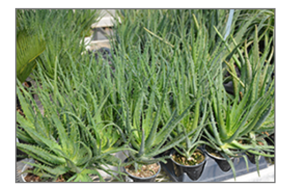
Aloe Vera