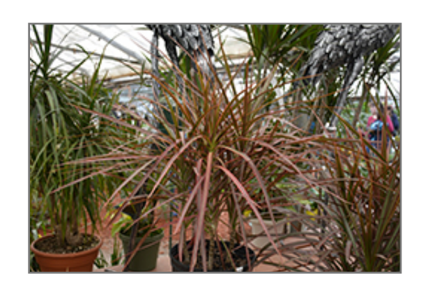
Tricolor Dracaena