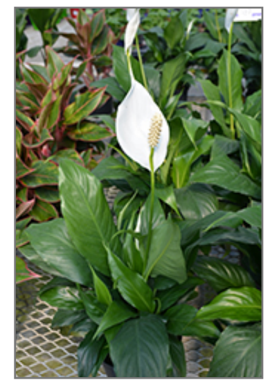
Sensation Peace Lily in bloom