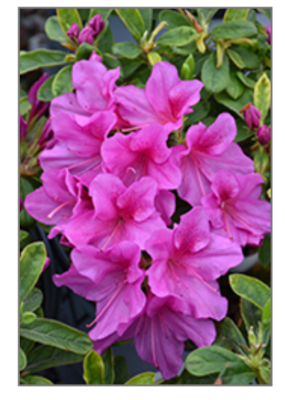
Bloom-A-Thon Lavender Azalea flowers