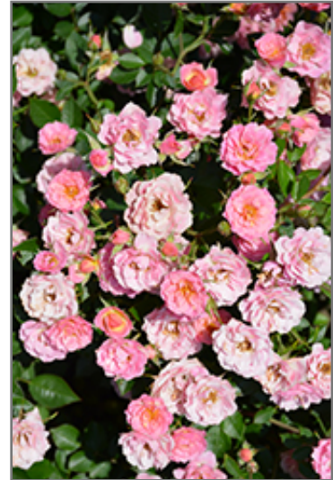
Oso Easy Petit Pink flowers