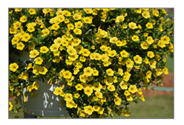
Million Bells Mounding Neon Yellow Calibrachoa flowers

This plant will require occasional maintenance and upkeep. Trim off the flower heads after they fade and die to encourage more blooms late into the season. It is a good choice for attracting bees and hummingbirds to your yard, but is not particularly attractive to deer who tend to leave it alone in favor of tastier treats. It has no significant negative characteristics.