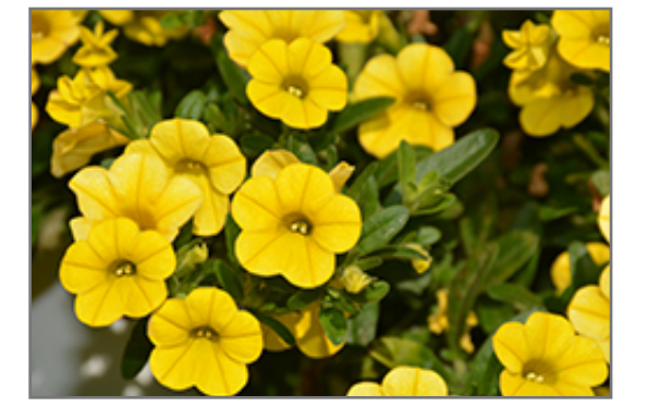
Million Bells Mounding Neon Yellow Calibrachoa flowers

Million Bells Mounding Neon Yellow Calibrachoa is a dense herbaceous annual with a mounded form. Its medium texture blends into the garden, but can always be balanced by a couple of finer or coarser plants for an effective composition.