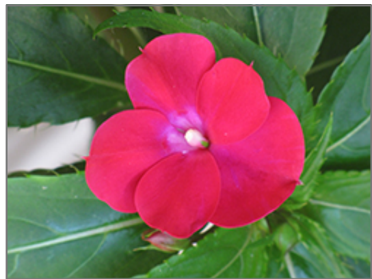
Infinity Cherry Red New Guinea Impatiens flowers