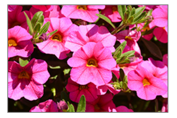
Aloha Kona Hot Pink Calibrachoa flowers

Aloha Kona Hot Pink Calibrachoa is recommended for the following landscape applications;