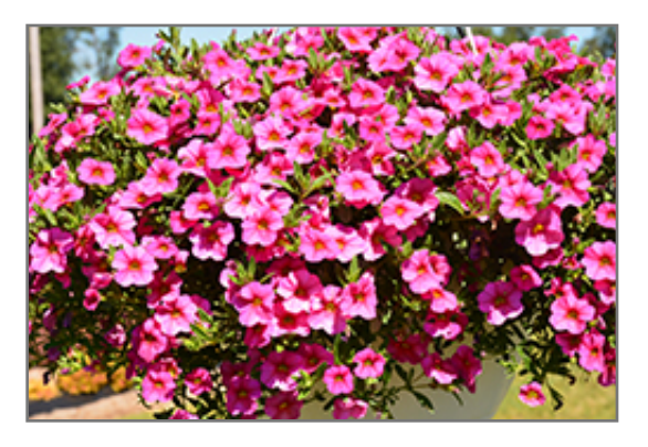
Aloha Kona Hot Pink Calibrachoa flowers

Bossier City - Shreveport - Longview - Texarkana - Beaumont