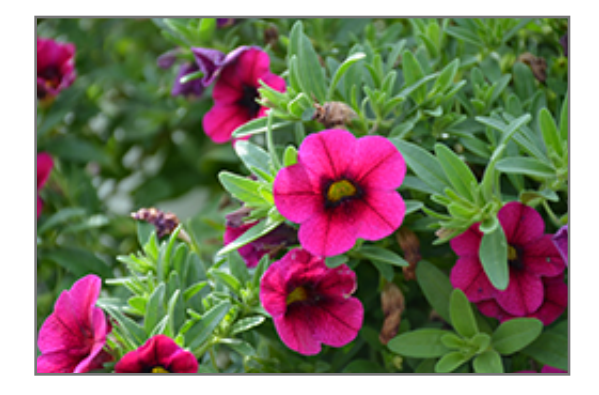
Aloha Raspberry Calibrachoa flowers

Aloha Raspberry Calibrachoa is recommended for the following landscape applications;