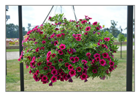
Aloha Raspberry Calibrachoa in bloom

Bossier City - Shreveport - Longview - Texarkana - Beaumont