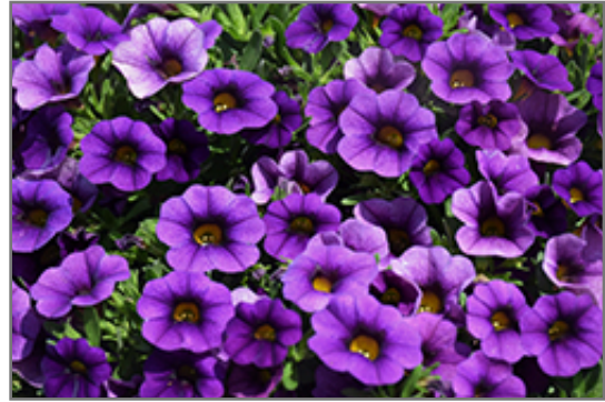
Calipetite Blue Calibrachoa flowers

This plant will require occasional maintenance and upkeep. Trim off the flower heads after they fade and die to encourage more blooms late into the season. It is a good choice for attracting bees and hummingbirds to your yard, but is not particularly attractive to deer who tend to leave it alone in favor of tastier treats. It has no significant negative characteristics.