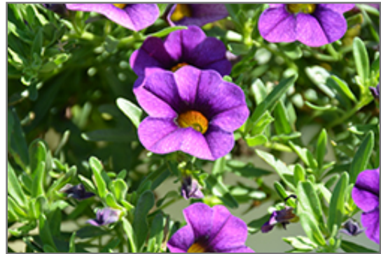
Calipetite Blue Calibrachoa flowers