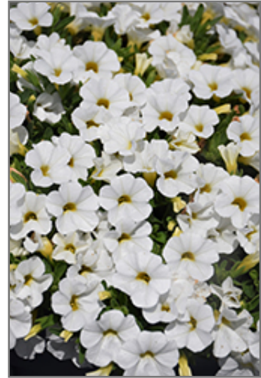
Calipetite White Calibrachoa flowers

This plant will require occasional maintenance and upkeep. Trim off the flower heads after they fade and die to encourage more blooms late into the season. It is a good choice for attracting bees and hummingbirds to your yard, but is not particularly attractive to deer who tend to leave it alone in favor of tastier treats. It has no significant negative characteristics.