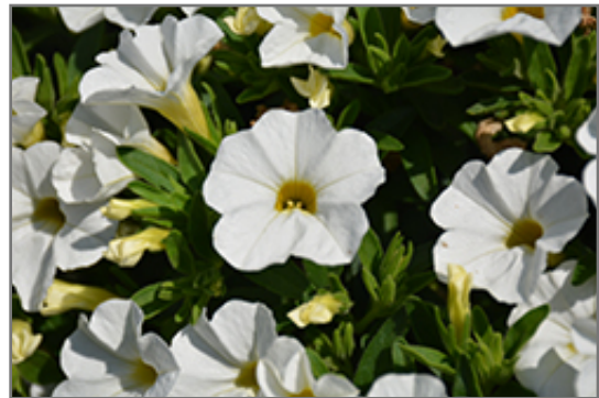
Calipetite White Calibrachoa flowers