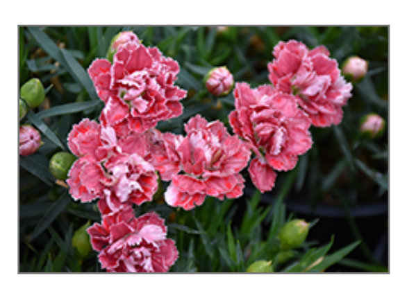
SuperTrouper Red and White Carnation flowers