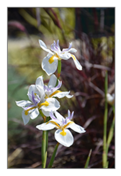
African Iris flowers

Bossier City - Shreveport - Longview - Texarkana - Beaumont