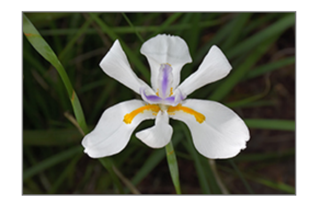
African Iris flowers