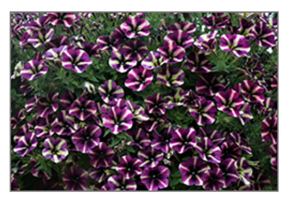
Crazytunia Blackberry Mojito Petunia flowers

This plant will require occasional maintenance and upkeep. Trim off the flower heads after they fade and die to encourage more blooms late into the season. It is a good choice for attracting butterflies and hummingbirds to your yard, but is not particularly attractive to deer who tend to leave it alone in favor of tastier treats. It has no significant negative characteristics.