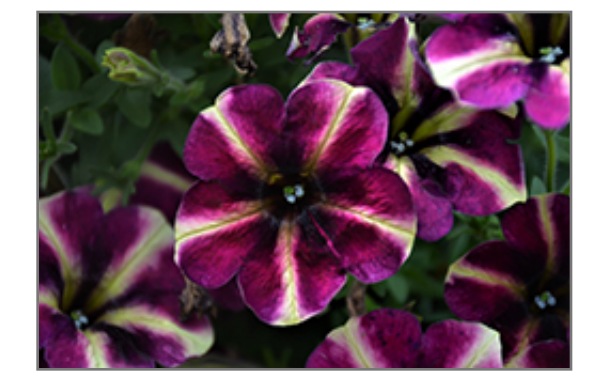
Crazytunia Blackberry Mojito Petunia flowers

Crazytunia Blackberry Mojito Petunia is a dense herbaceous annual with a mounded form. Its medium texture blends into the garden, but can always be balanced by a couple of finer or coarser plants for an effective composition.