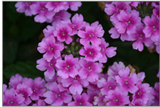
EnduraScape Pink Bicolor Verbena flowers

This plant will require occasional maintenance and upkeep. Trim off the flower heads after they fade and die to encourage more blooms late into the season. Deer don't particularly care for this plant and will usually leave it alone in favor of tastier treats. It has no significant negative characteristics.